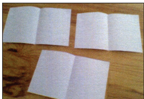
ELLE PAUNON/JOE SERNA JR. CHARTER SCHOOL

Place your folded printer paper inside the folded colored paper. Then, once you have the printer paper inside the colored paper, grab a rubber band and wrap it around your book. And there you have it! Your very own field journal! You can use this to observe what you see outside and take notes!