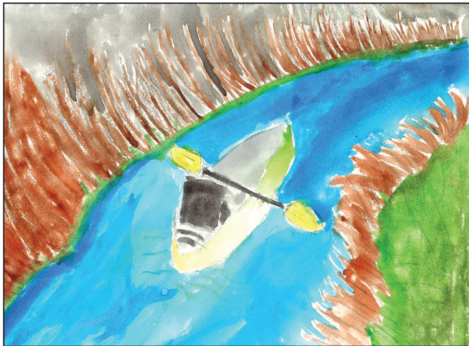
HALEY DOCKERY/VINEWOOD ELEMENTARY SCHOOL