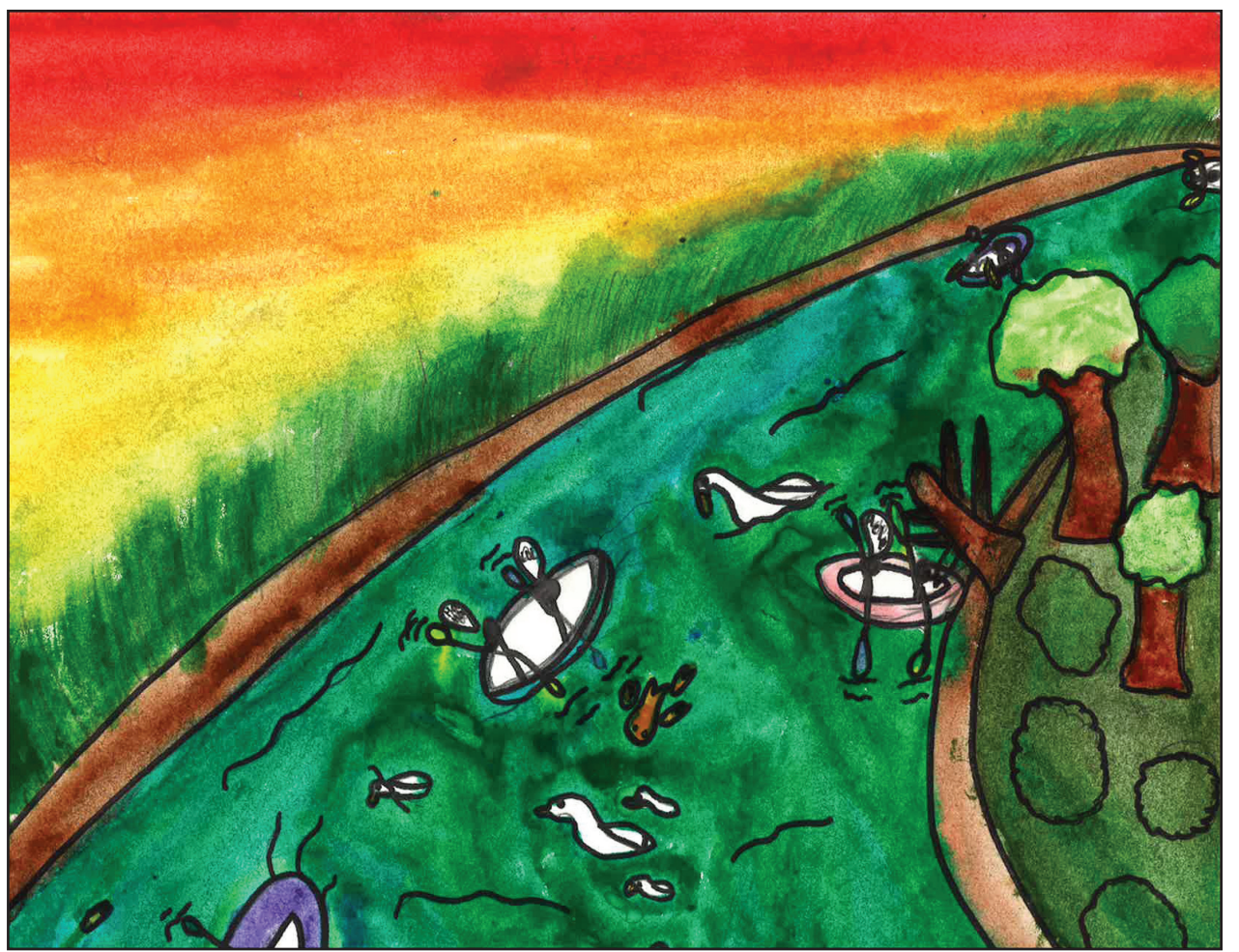
ASHLEY GALLETTI/VINEWOOD ELEMENTARY SCHOOL

Sitting In The Kayak with a friend to join me The fish are splashing in the water The Kayak moving Gently Calming waters all around Fluffy Beautiful clouds all around me Butterflies flying around plants The water looked calming and relaxing I would love to come back to this wonderful place