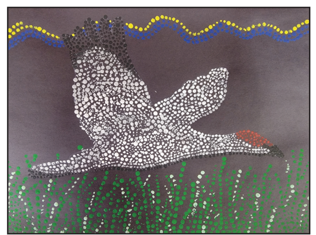
KATIE CRISP/REESE ELEMENTARY SCHOOL