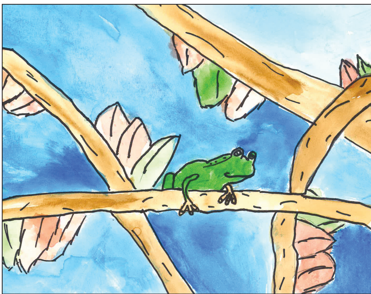
GWEN DALEY/VINEWOOD ELEMENTARY SCHOOL