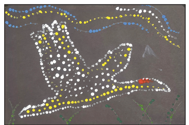
ARFA UZAIR/HERITAGE ELEMENTARY SCHOOL