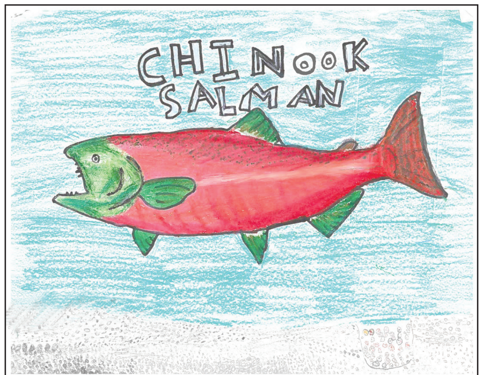
GRACIE BOLANOS/REESE ELEMENTARY SCHOOL